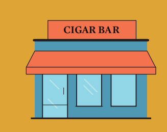
Cigar bars, that meet certain requirements.